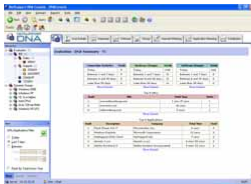
Figure 1. DNA tracks information on monitored computers, including what applications have been opened and how long they've been used. (Click image to view larger version.)

You manage DNA with the NetSupport DNA Console, which runs inside a java virtual machine (see Figure 1). It will run on any machine with Windows NT 4.0 or higher and IE 6.0. I found the DNA Console extremely easy to use—after about 20 minutes, I was zipping around like an old pro.