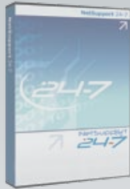
On Demand Remote Support