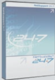
On Demand Remote Support