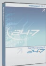
On Demand Remote Support