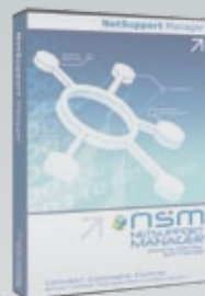
PC Remote Control